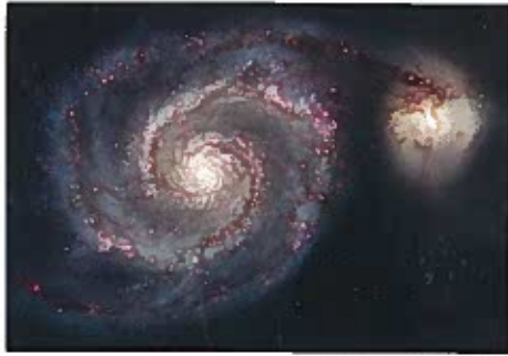
The Whirlpool Galaxy and Companion Galaxy

1125 W. Lake Ave. Peoria, IL 61614 Ph: (309) 686-7000 Fax: 309-686-0280 Website: www.lakeview-museum.org